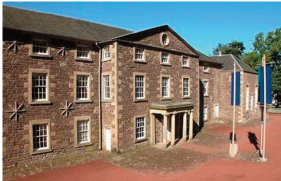
Robert Owen's Institute

New Lanark is a World Heritage Site. It is a beautifully restored 18th century cotton milling village in Southern Scotland, beside the Falls of Clyde and less than an hour from Edinburgh and Glasgow.